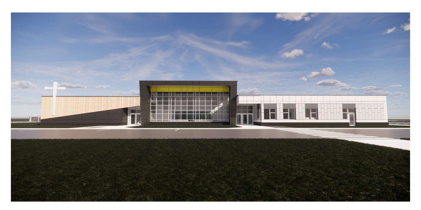
The P3 Development of a new kindergarten to grade 5 school in Blackfalds continues to move forward. The schematic design has progressed smoothly and the plans look excellent. We also received official notification that a full build out to just over 500 students was approved.

Work is ongoing between Alberta Infrastructure and the town of Blackfalds to ensure the steps to secure the land in the new development are completed. The land needs to be ready for construction according to the timelines and criteria established in the P3 project. This component has been challenging as much work is still needed to be done to secure title to the land within the development and appropriate elevations need to be created on site. Several key steps still need to be accomplished and increased collaboration between Alberta Infrastructure and the town has been initiated to meet these deadlines.